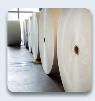
The Paper Mill ...is excited to have direct access to you — the end user.

GBS is a full-service print management company. We provide full national distribution and have participation from major paper mills. The Directed Paper Program brings the leverage of Fortune 100 companies to organizations of all sizes.