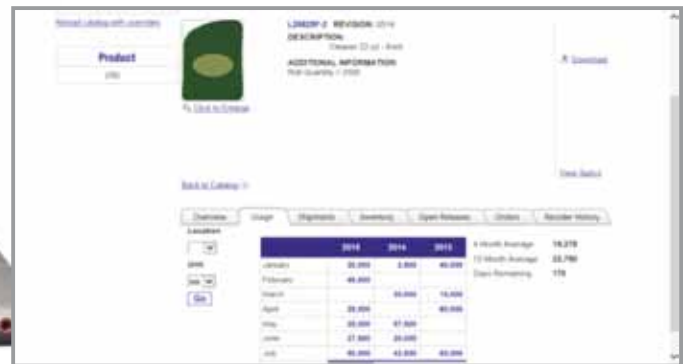
Detailed usage information

MyGBS is an online single-source catalog for creating, managing, deploying and retrieving your print and label items. Users have 24/7 controlled access to an assortment of item actions and functionality via a secured access and multiple browser and login options.