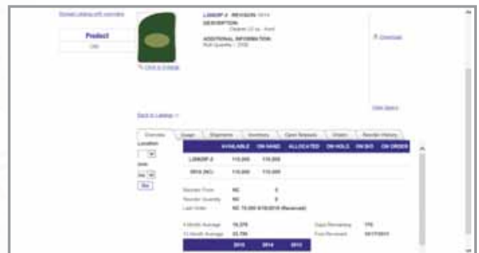
Detail overview of each item