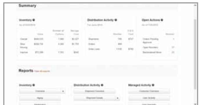
Complete inventory information